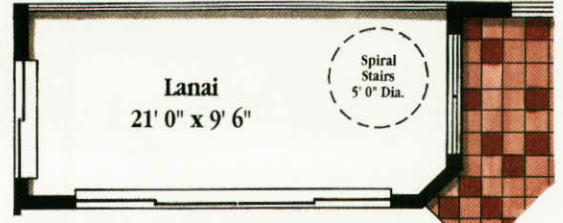
Optional 1st floor with viewing deck