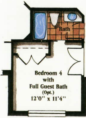
Optional Bedroom 4