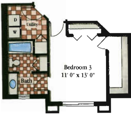
Optional Bedroom 3