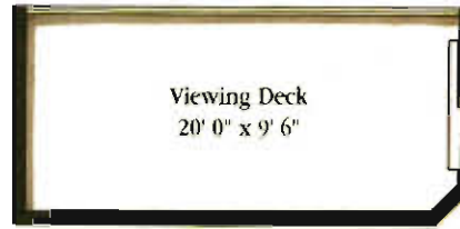
Optional 2nd floor viewing deck