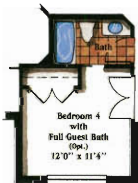
Optional Bedroom 4