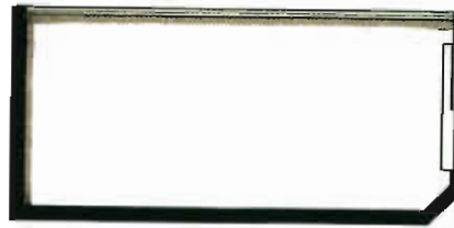
Optional 2nd floor viewing deck