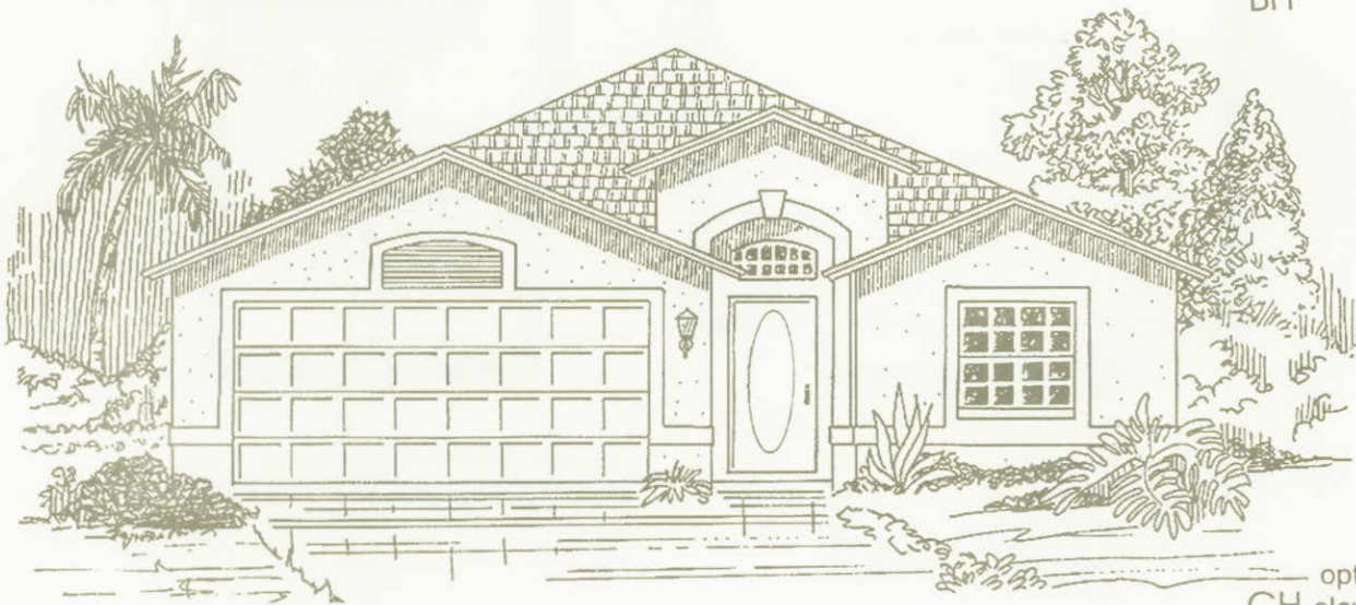
optional CH elevation