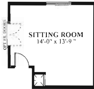
OPT. SITTING ROOM