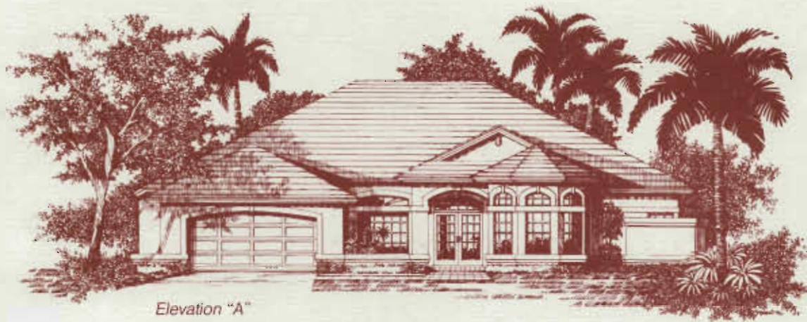
Elevation "A" Alternate Exteriors Available