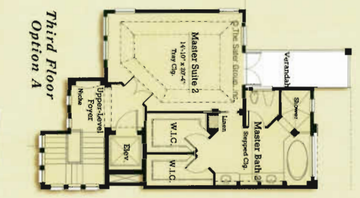
Third Floor Option A