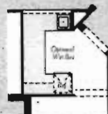
OPTIONAL WET BAR