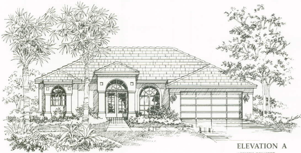
ELEVATION A ARTIST'S CONCEPT