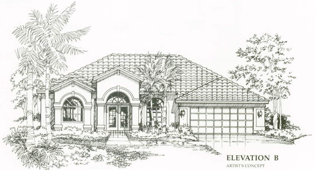
ELEVATION B ARTIST'S CONCEPT