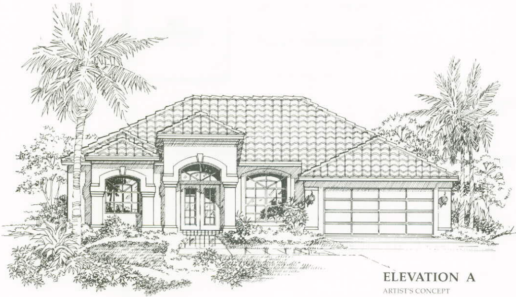
ELEVATION A ARTIST'S CONCEPT