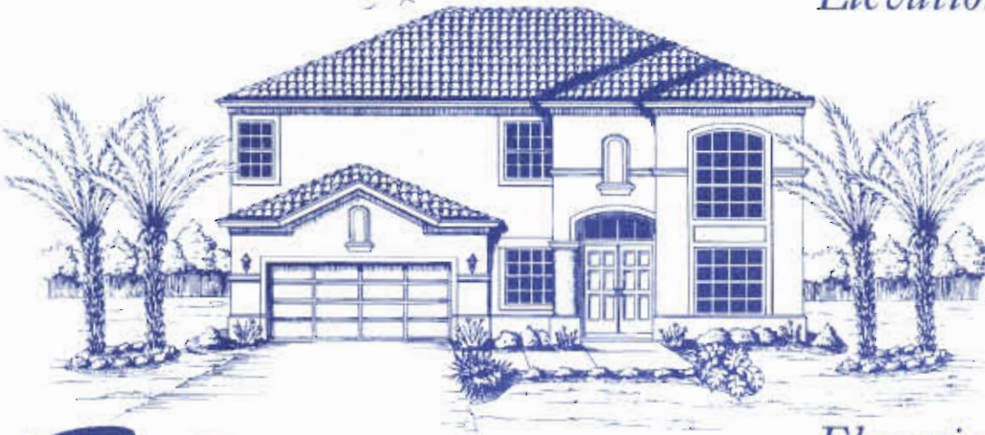
Elevation C Round Column