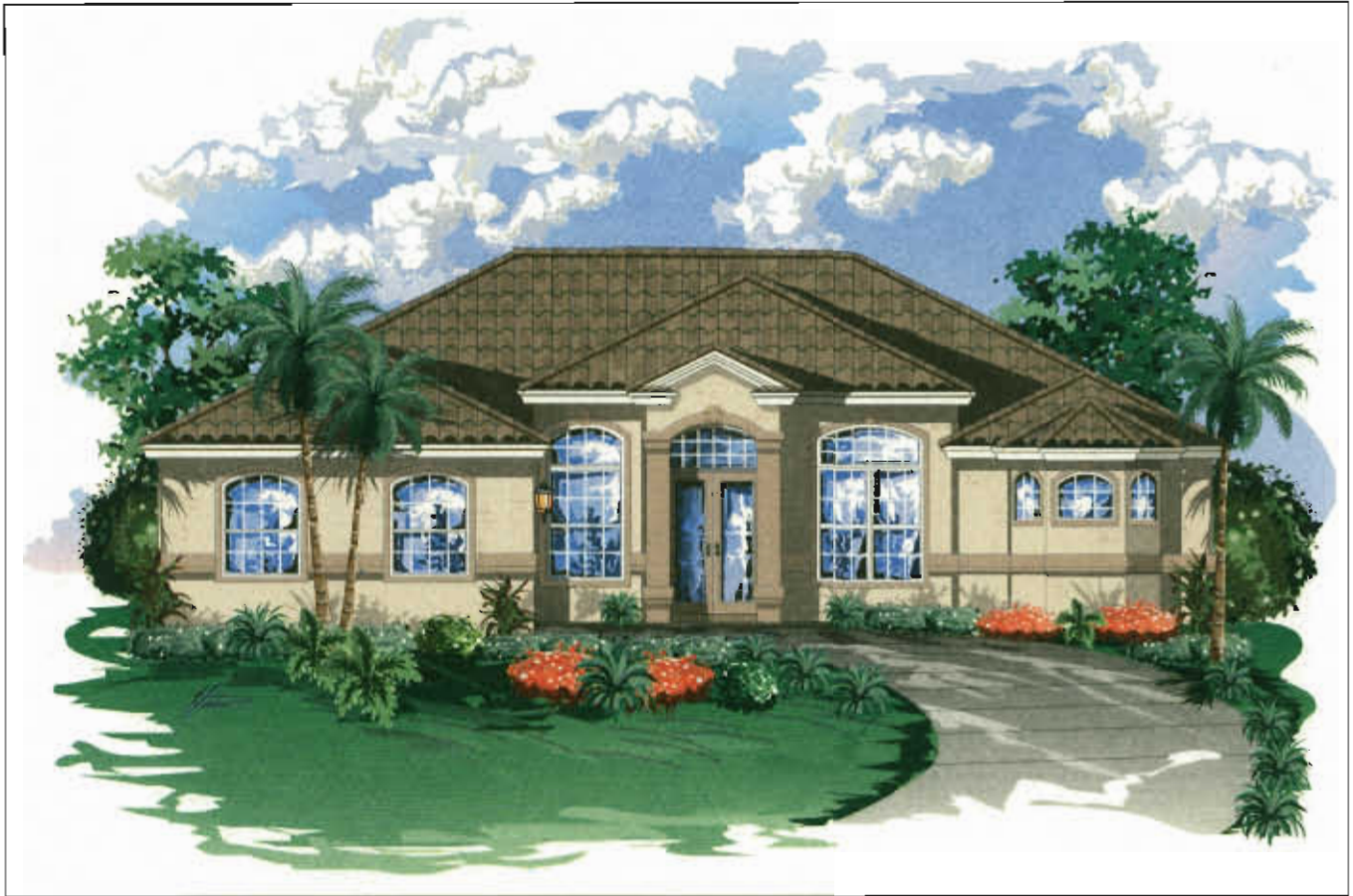
THE SONOMA by Gulfstream Homes