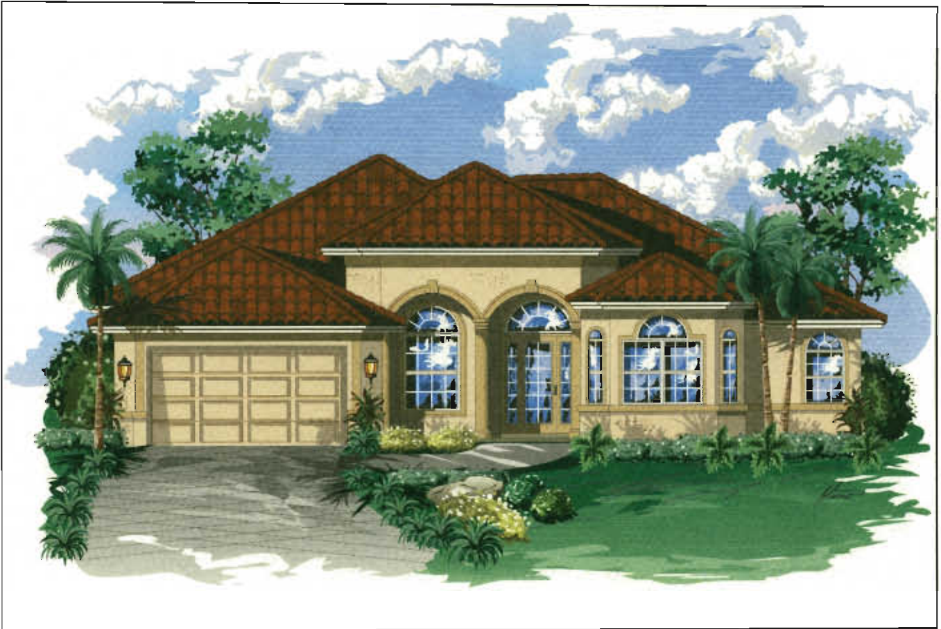
THE MONTEREY by Gulfstream Homes