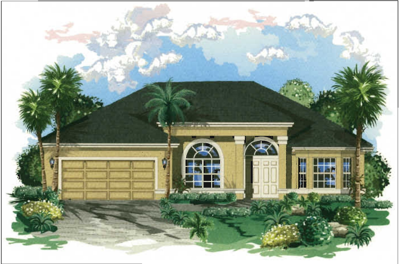
THE MARINER by Gulfstream Homes