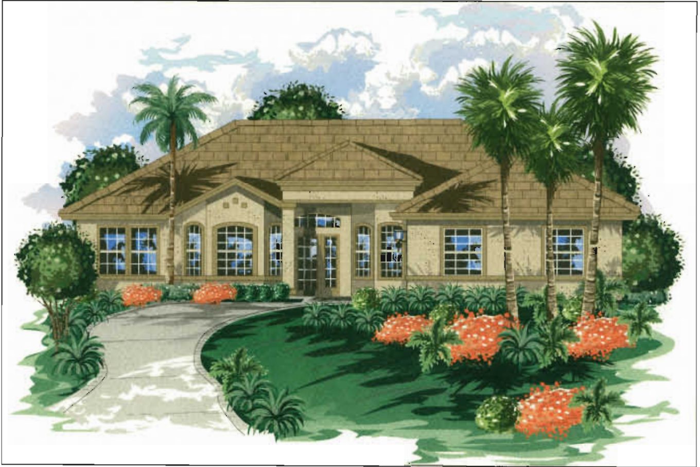
THE GULFSTREAM by Gulfstream Homes