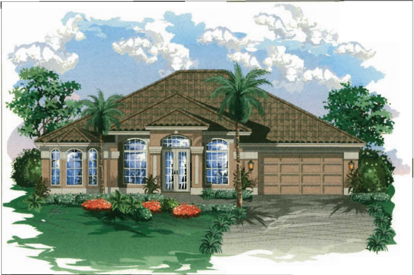
THE CEDARBROOK by Gulfstream Homes