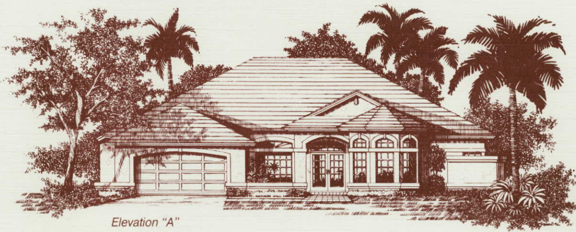
Elevation "A" Alternate Exteriors Available